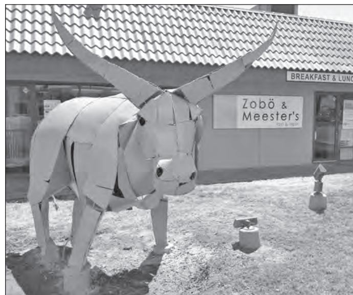
The next chamber mixer is Thursday, April 21, 5 to 7 p.m. at Zobo and Meesters (the Green Bull), 68703 Perez Road, A-1. Admission is $5; network with local members.