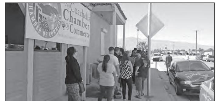
Desert Personnel @ Work hosted a job fair March 23 at the Coachella Chamber of Commerce Office at which some 200 applicants came to apply for Coachella Arts and Music Festival and Stagecoach jobs.