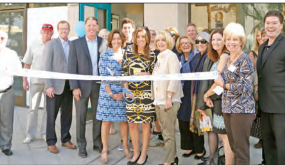
...n El Paseo

...n. at 73345 Highway 111, Palm Desert. ...brations for Formation Stone will be May 4, 4 p.m. at ...2nd Avenue, Palm Desert.