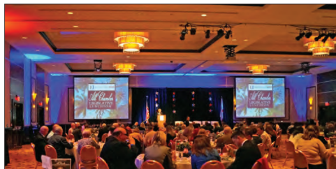
Palm Desert Chamber was a host for the All Chamber Legislative Luncheon recently at the Agua Caliente Spa Resort for more than 200 people.