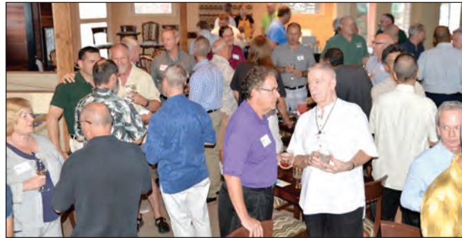
A recent DBA mixer in action is from Twin Palms Bistro & Lounge.