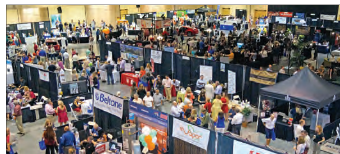
Event floor with plenty of exhibitors