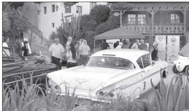
Exotic Cars are displayed before the villas of Colony 29 Palm Springs during the Palm Springs Chamber of Commerce Business Expo & Taste of Palm Springs