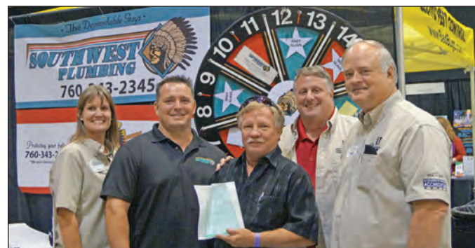
Most Interactive Booth – won by Southwest Plumbing, owners pictured along with members of the Chamber Board