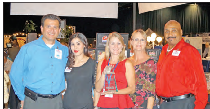
the Costco Palm Desert Marketing Team, and PREMIER SPONSOR of the Event