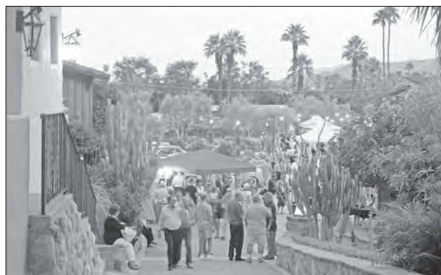
The lush grounds of Colony 29 Palm Springs were the perfect venue for the Palm Springs Chamber of Commerce Business Expo & Taste of Palm Springs