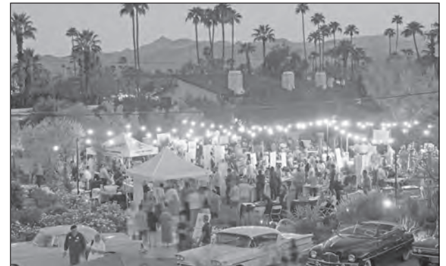
An estimated 3800 visitors attended this year's Palm Springs Chamber of Commerce Business Expo & Taste of Palm Springs at Colony 29 Palm Springs