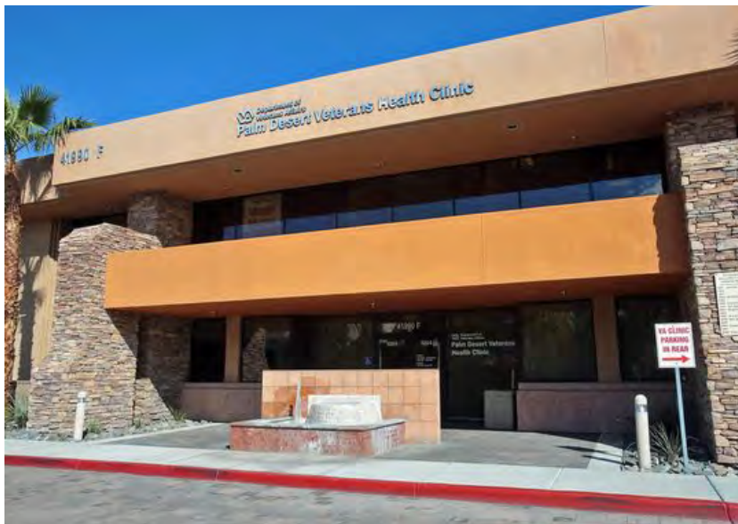
The Department of Veterans Affairs Palm Desert Health Clinic is located along Cook St., as seen on Tuesday, March 3, 2015.