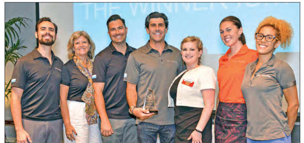
Winners Renova Solar - Mental Health & Well Being, Large Business

Wellness programs have been increasingly gaining popularity. Workplace wellness programs benefit the overall health of the employee and also benefit the organization by increasing productiv-