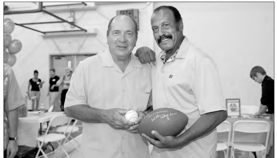
Baseball great Johnny Bench (left) with Football Great Fred "The Hammer" Williamson (right), who made a special guest appearance and autographed baseballs and footballs at the event.

With more than 800 business and community leaders attending, the one-on-one networking opportunities make the Summit a "must attend" event.